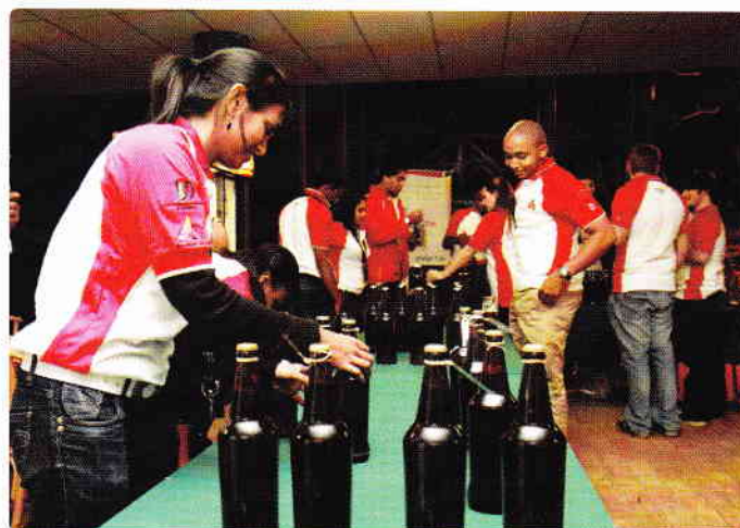
Laying out the tables for sampling.