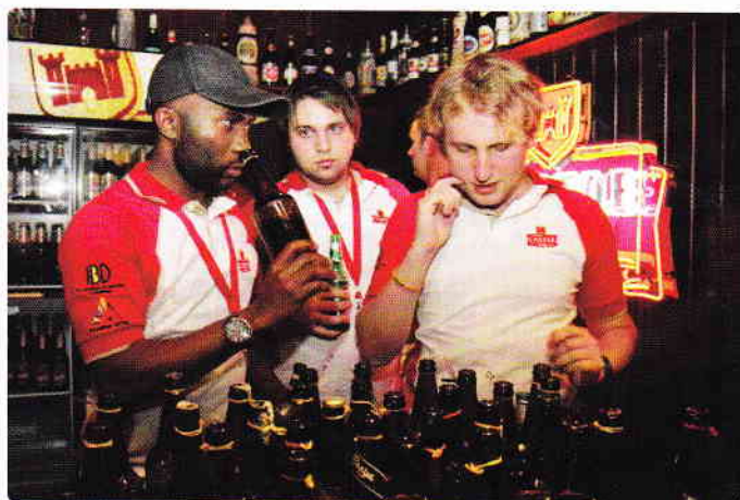
Preparing for tasting: a quick sniff and a count to check they are all there.