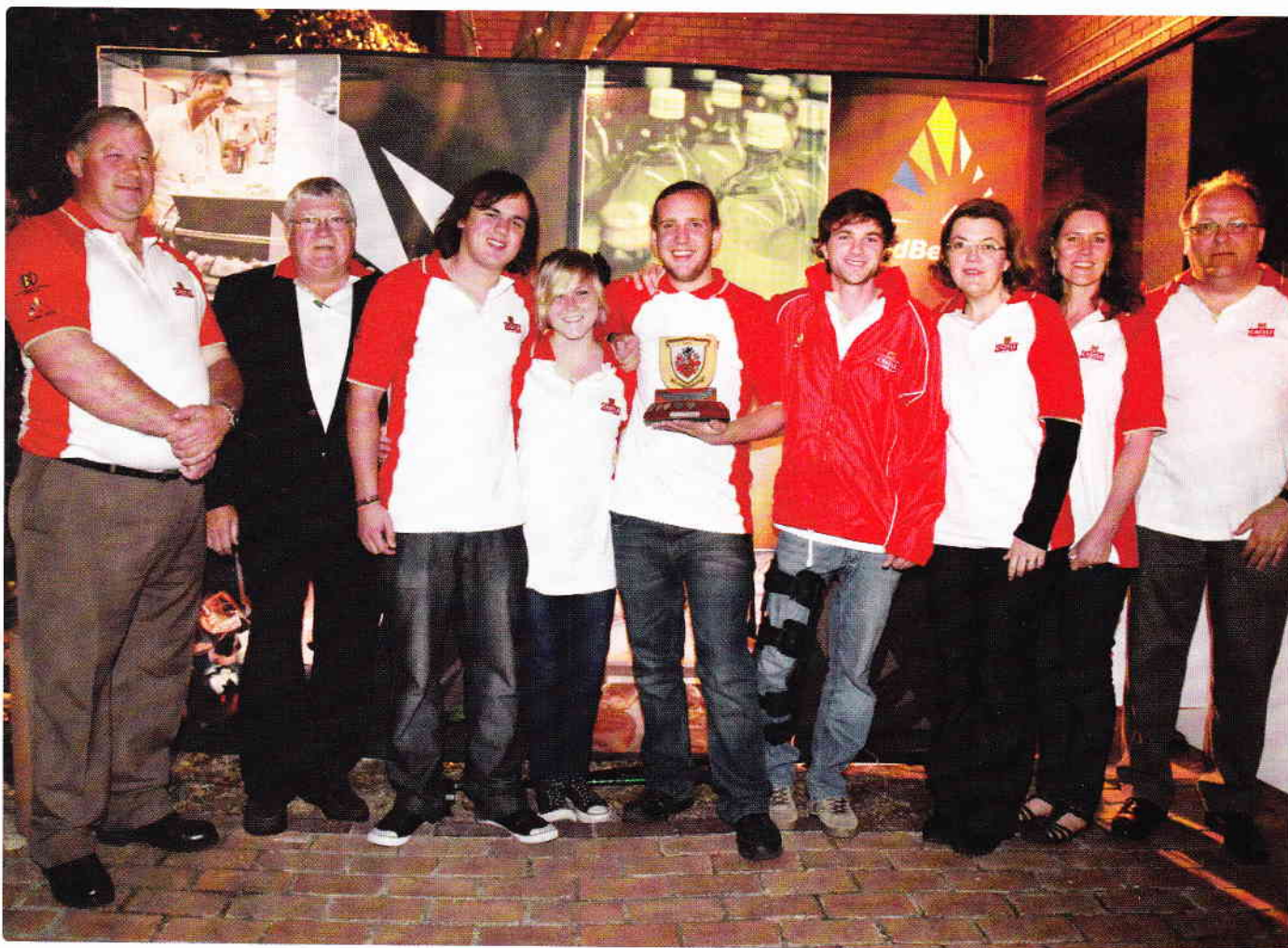
Winners of the FoodBev SETA Best Label competition – Rhodes University from Grahamstown in the Eastern Cape.