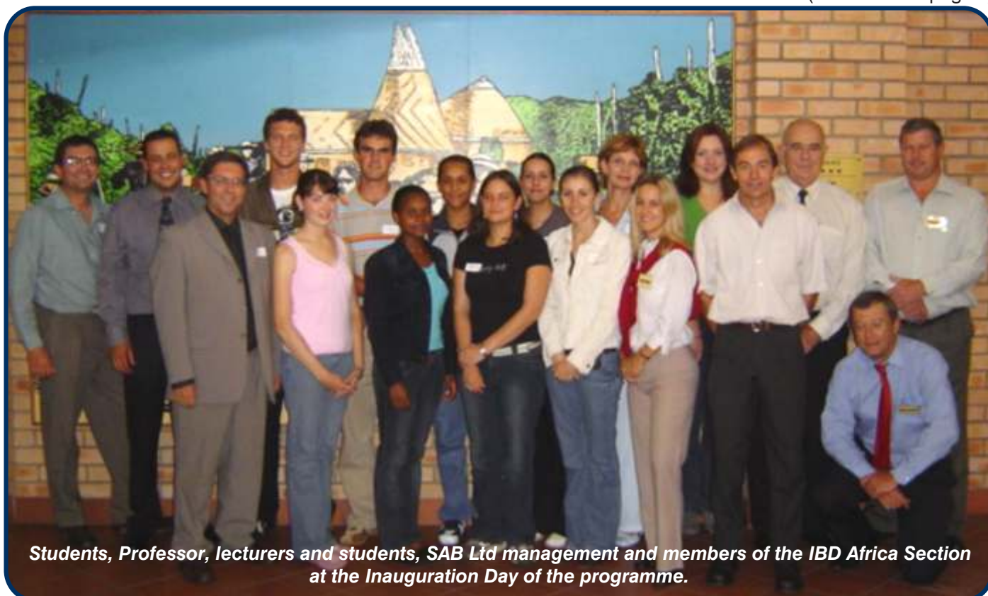
Students, Professor, lecturers and students, SAB Ltd management and members of the IBD Africa Section at the Inauguration Day of the programme.